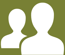
Customer Services Management